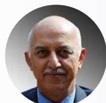
Vishweshwaraiah Prakash Ramaiah University of Applied Sciences, India